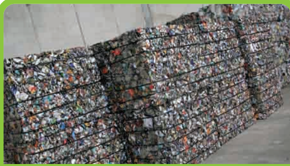
Separated materials are baled and stored, ready to be transported to various processing sites.