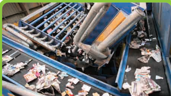
The 'ballistic separator' shakes the materials and smaller items fall through holes onto another conveyor belt.