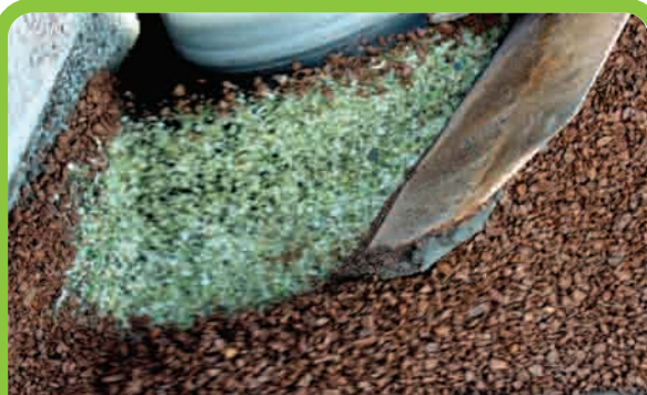
Glass can be turned into a variety of aggregates.