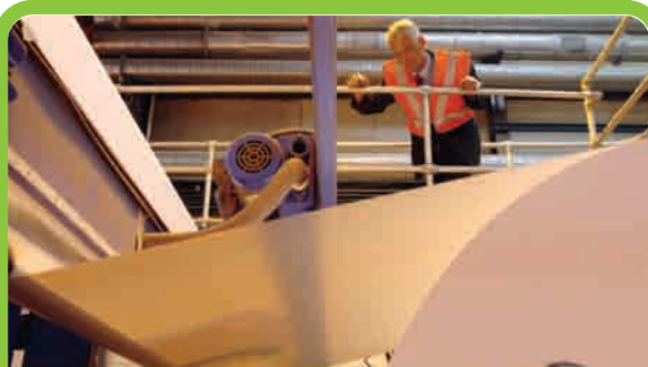
The clean fibres are turned into new paper which is wound onto reels so it can be sold on.