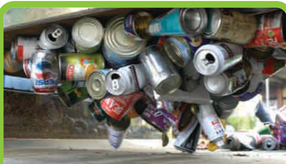
Aluminium and steel cans are shredded and melted before being turned into new products such as new cans, car or airplane parts.

for recycling. This is because of market fluctuations and because the type of facilities for recycling materials is limited in the UK. There are strict controls to ensure that materials that are exported are actually recycled. To minimise the impact of transportation materials are often put into ships that have delivered products to the UK and would otherwise have returned to their home country empty. Regardless of where the materials are sent a waste transfer note is given to the MRF operator to provide evidence that materials have been sent for recycling.