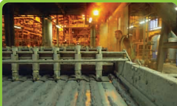
Paper is pulped and any ink is removed.