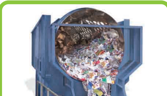
The rotating 'trommel' filters out any remaining small items, leaving paper, cardboard and orange sacks behind.