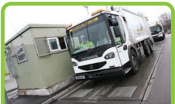
The collection vehicles are weighed on arrival at the station.