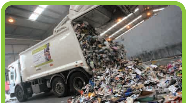
Recyclables are tipped into a tipping bay and inspected for quality purposes.

Depending on where you live, your recycling may be bulked at Smugglers Way in Wandsworth, Cringle Dock in Battersea or Cremorne Wharf in Chelsea.