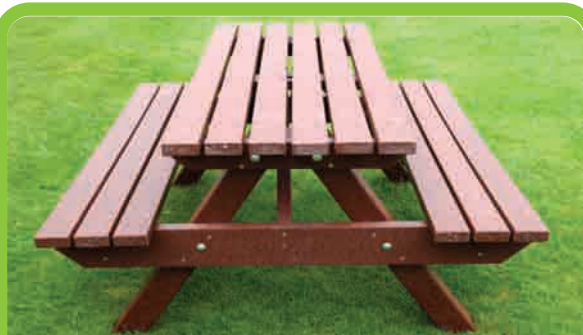
Plastic can be turned into a variety of new products, including new bottles, orange sacks, fleeces or garden furniture.