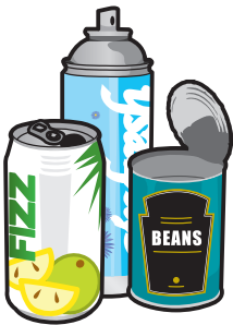
Tins, cans and empty aerosols