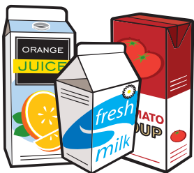
Food and drinks cartons