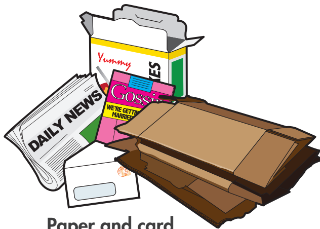
Paper and card