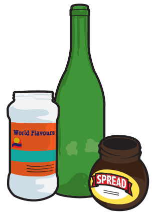
Glass bottles and jars - no tops or lids