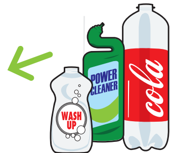
Plastic bottles - no tops or lids